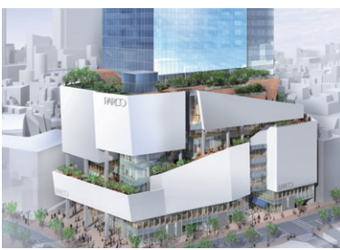
November 2019 Rendering of Shibuya Parco ©2019, Takenaka Corporation