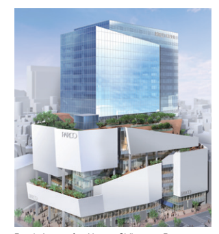
Rendering of New Shibuya Parco, an environmentally friendly next generation building

of high-efficiency energy including a system cogeneration system (CGS) (*1); and (3) Use of digital communication technology to promote efficient energy use. In addition to installing the latest equipment and fixtures, we will also "visualize" energy efficiency for energy