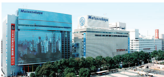
Matsuzakaya Nagoya (Floor space: 86,758m 2 )