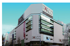
Sapporo Parco 3-3, Minami 1-jo Nishi, Chuo-ku, Sapporo, Hokkaido B2F-8F Opened: August 24, 1975