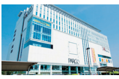
Urawa Parco 11-1, Higashitakasago-cho, Urawa-ku, Saitama B1F-7F Opened: October 10, 2007