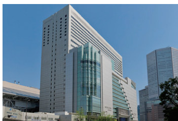
Daimaru Osaka Umeda (Floor space: 64,000m 2 )