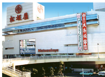
Matsuzakaya Takatsuki (Floor space: 17,387m 2 )