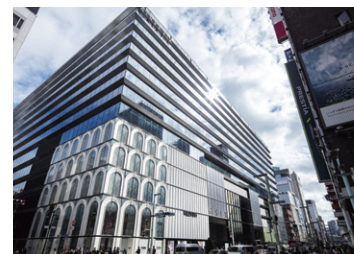
Ginza Six (Floor space: 47,000m 2 )