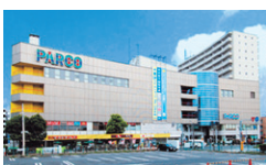
Hibarigaoka Parco 1-1-1, Hibarigaoka, Nishitokyo, Tokyo B1F-5F Opened: October 8, 1993