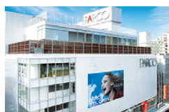
Shizuoka Parco 6-7, Koyamachi, Aoi-ku, Shizuoka B1F-8F Opened: March 15, 2007