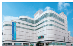
Chofu Parco 1-38-1, Kojima-cho, Chofu, Tokyo B1F-10F Opened: May 25, 1989