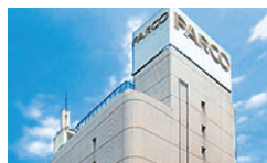
Kichijoji Parco 1-5-1, Kichijojihoncho, Musashino, Tokyo B2F-8F Opened: September 21, 1980