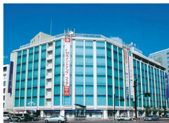
Matsuzakaya Shizuoka (Floor space: 25,452m 2 )