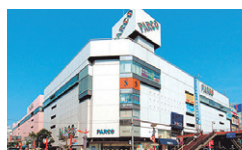
Tsudanuma Parco 2-18-1, Maebaraniishi, Funabashi, Chiba Building A: B1F-6F Building B: B1F-6F Opened: July 1, 1977