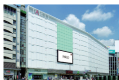
Ikebukuro Parco 1-28-2, Minami-Ikebukuro, Toshima-ku, Tokyo Main Building: B2F-8F Opened: November 23, 1969 P'Parco: B2F-8F Opened: March 10, 1994