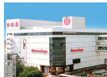
Matsuzakaya Toyota (Floor space: 18,220m 2 )