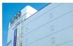
Matsumoto Parco 1-10-30, Chuo, Matsumoto, Nagano B1F-6F Opened: August 23, 1984