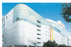
Nagoya Parco 3-29-1, Sakae, Naka-ku, Nagoya, Aichi West Building: B1F-11F East Building: B1F-8F Opened: June 29, 1989 South Building: B1F-10F Opened: November 6, 1998 Parco midi: 1F-3F Opened: March 27, 2015