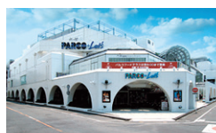
Shintokorozawa Parco 1-2-1, Midori-cho, Tokorozawa, Saitama Parco: B1F-5F Let's: B1F-4F Opened: June 23, 1983