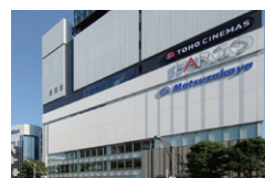
Parco_ya 3-24-6, Ueno, Taito-ku, Tokyo 1F-6F Opened: November 4, 2017