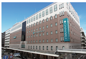
Daimaru Kyoto (Floor space: 50,830m 2 )