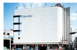
Kochi Daimaru (Floor space: 16,068m 2 )