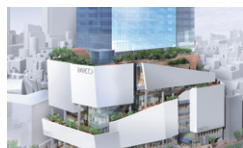
Shibuya Parco Udagawa-cho 15-1, Shibuya-ku, Tokyo B3F-19F Scheduled to open in late November 2019 Club Quattro 32-13, Udagawa-cho, Shibuya-ku, Tokyo 4F-5F Opened: June 28, 1988