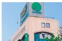
Daimaru Ashiya (Floor space: 3,395m 2 )