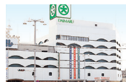
Shimonoseki Daimaru (Floor space: 23,912m 2 )