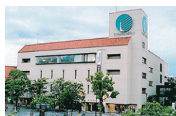
Daimaru Suma (Floor space: 13,076m 2 )