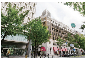
Daimaru Osaka Shinsaibashi (Floor space: 46,490m 2 ) *The new main building is scheduled to open on September 20, 2019.