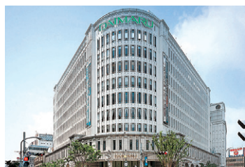
Daimaru Kobe (Floor space: 50,656m 2 )