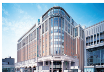
Daimaru Sapporo (Floor space: 45,000m 2 )