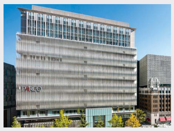
Shinsaibashi PARCO (Opened in November 2020)