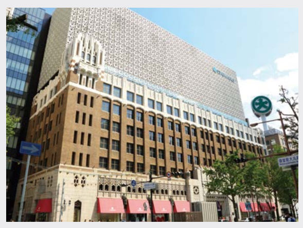
Main building of Daimaru Osaka Shinsaibashi (Opened in September 2019)