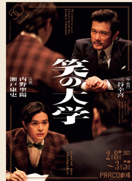
“Warai no Daigaku,” PARCO Theater 50th Anniversary Series

The two-person play “Warai no Daigaku” was staged at PARCO Theater from February to March 2023. It was first performed as a Parco production in 1996. The theatrical masterpiece, which won the Best Play award at the 4th Yomiuri Theater Awards, was restaged in 1998, and also translated and performed in Russia, South Korea, China, and France.