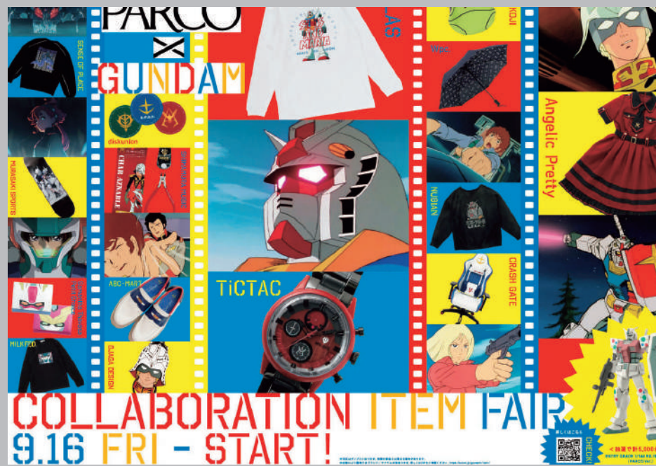
Poster for PARCO x GUNDAM COLLABORATION ITEM FAIR