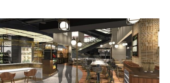
B2: Food hall