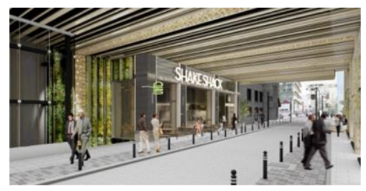
1F: Daihoji Street