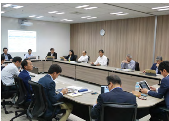
2nd Sustainability Committee meeting

The Group created the Sustainability Committee to promote sustainability management in a cross-organizational manner in all companies in the Group. The Committee, as well as the Risk Management Committee and the Compliance Committee, is positioned as an advisory committee directly under the President and Representative Executive Officer. It meets biannually to develop action plans and monitor the progress concerning the five materiality issues of each operating company. The Board of Directors receives reports about what was discussed at the Sustainability Committee meetings and discusses and supervises the long-term goals on ESG issues and the progress of actions.