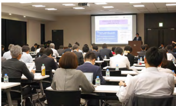
2nd ESG presentation